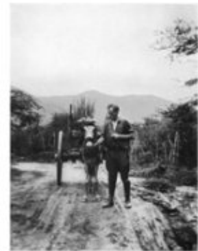
Mein vierbeiniger Kollege, der Mulo, beim Abtransport der erbeuteten Pflanzen

Probably, the first travelog of Backeberg where he pays tribute to his teachers. 72 black and white pictures, some from Frič.