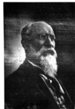
Carlos Spegazzini 1828-1901