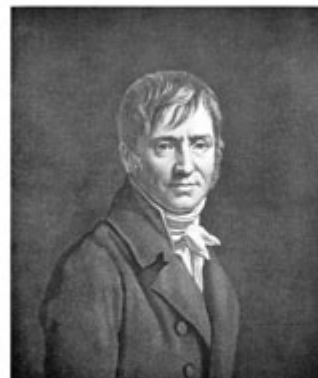
Pierre-Joseph Redouté "Raphael of the Succulents"

Reprinted from The Cactus and Succulent Society Journal 1956-7